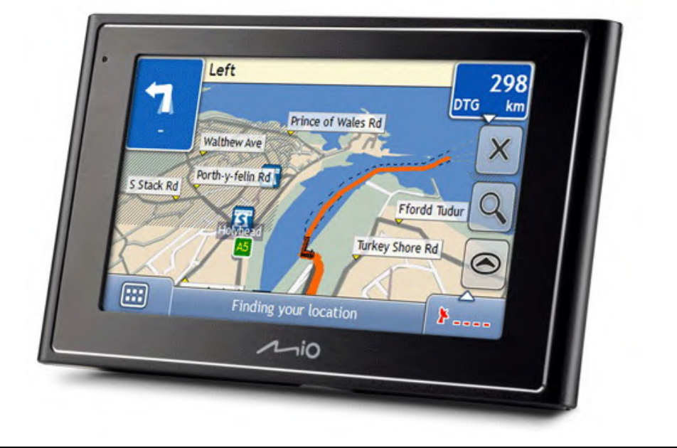
Figure 1: Mio Moov 380